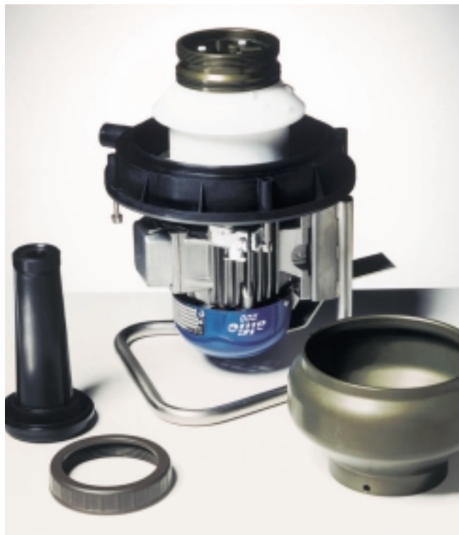
The separator is fed by a conical-shaped centrifugal pump, which is operated by the same electric motor as the separator.