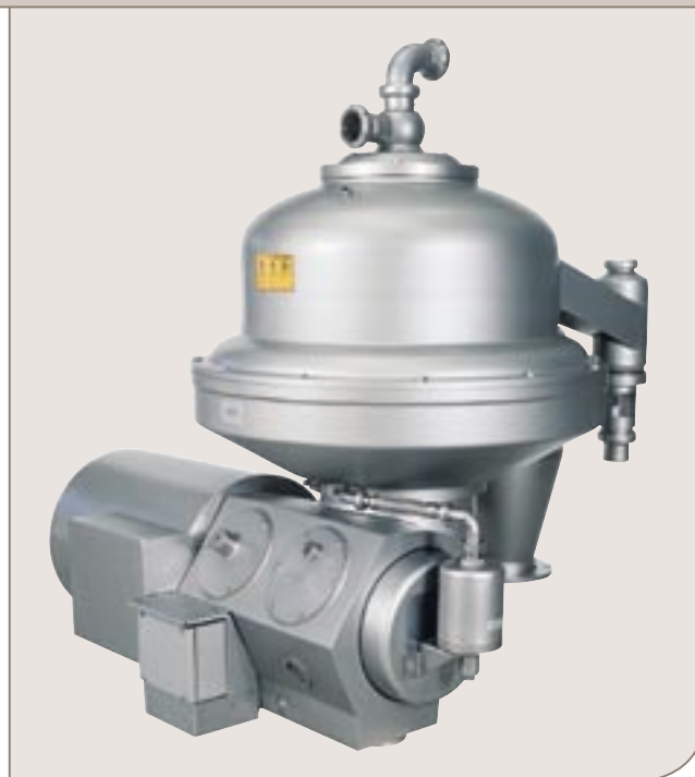
Fig. 1 AFPX 617 complete with motor

The machine consists of a frame that has a horizontal drive shaft with clutch and brake, worm gear, lubricating oil bath and vertical bowl spindle in the lower part. The bowl is mounted on top of the spindle, inside the space formed by the upper part of the frame, the ring solids cover, the collecting cover, and the frame hood. The feed and liquid discharge system, including the paring disc pump for the heavy phase, also rests on this structure. All parts in contact with the process liquid are made of stainless steel. The bowl is of the solids-ejecting disc type with a hydraulic operating system for "shooting" (for automatic or manual operation). The electric motor is of the variable frequency drive type or of controlled-torque type.